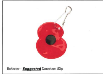
Reflector - Suggested Donation: 50p