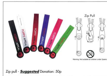
Zip pull - Suggested Donation: 50p