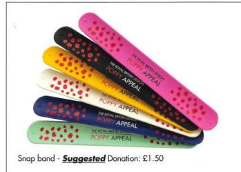
Snap band - Suggested Donation: £1.50